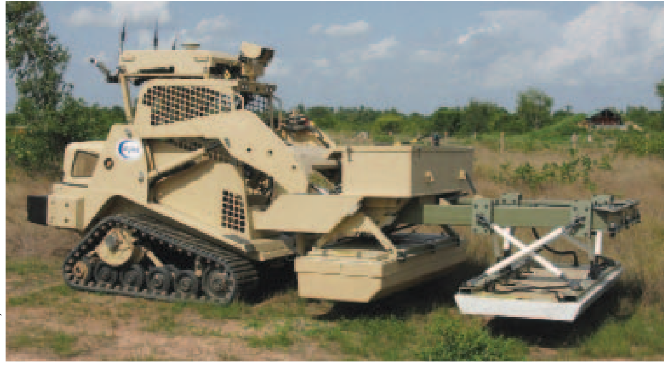
The Nemesis Demining System.

"Our FCCS features a unique tension system that allows the cable to be paid out and retrieved smoothly and automatically," Timian says. "So, the operator doesn't have to pay particular attention to the path of the cable, except they have to follow the direction of the fiber cable when bringing the robot