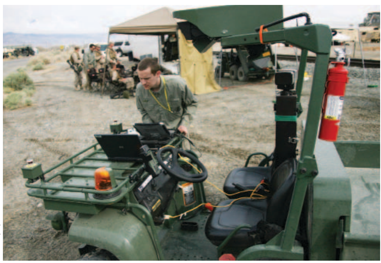
A robotic systems engineer conducts a systems check of a robotic UGV before making it available for test training with US Marine Corps infantrymen.

Ruggedized, tactical-grade fiber-optic cable provides control and monitoring of robotic UGV equipment, enabling life-saving functions over surprising distances.