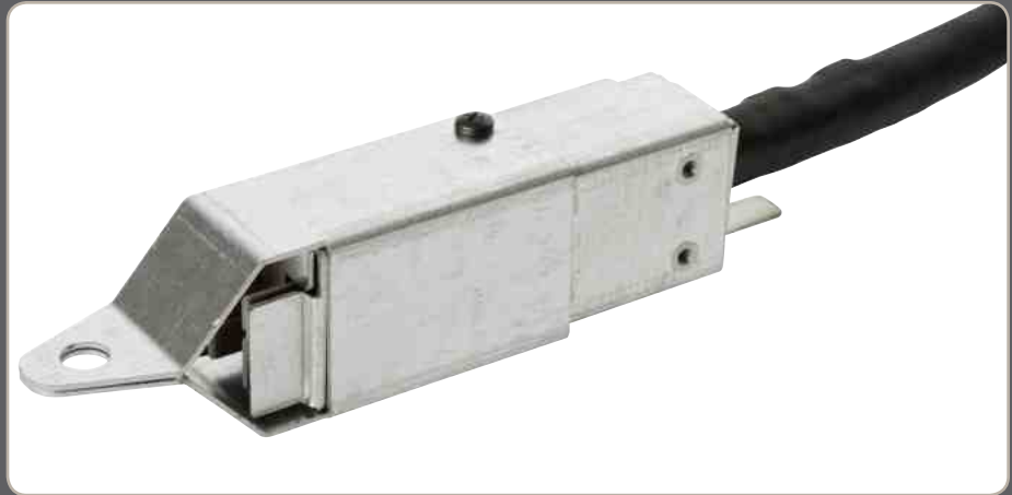
Procyon Copper Cable Assembly with pulling eye