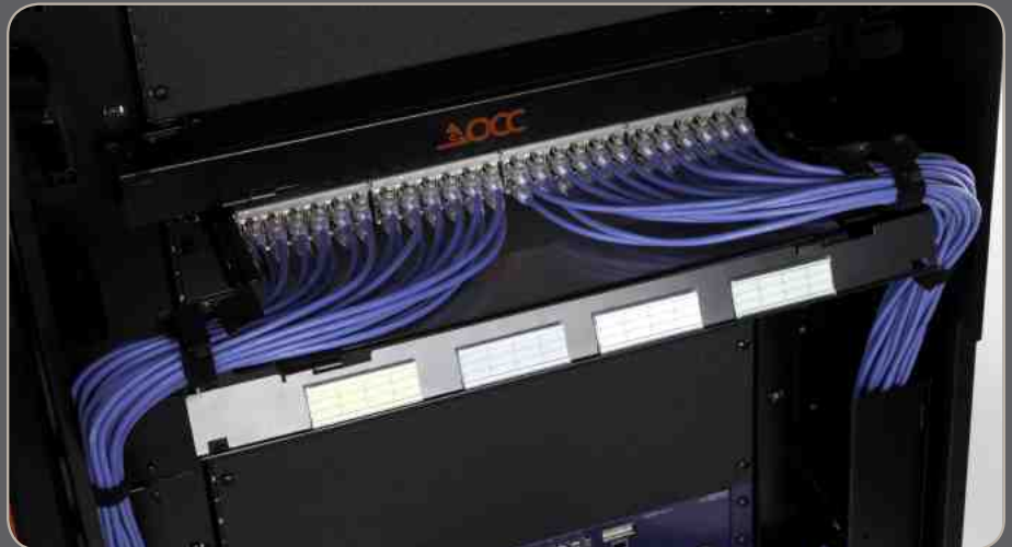
Procyon Copper panel with integrated Cable Management