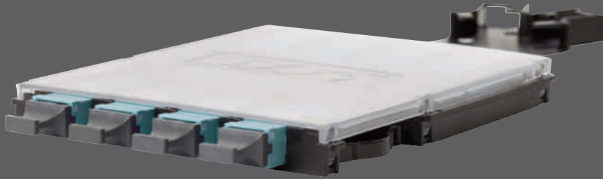
Procyon MTP-MTP Cassette