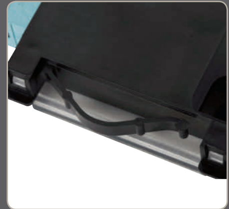
Close-up of bow clip mechanism