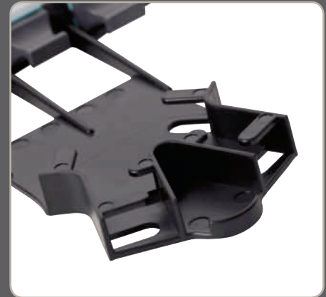
Close-up of pull tab