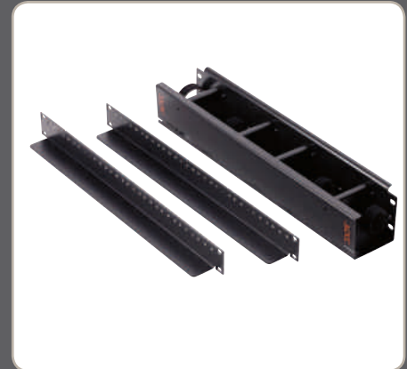
Vertical Mounting Brackets with Cable Manager