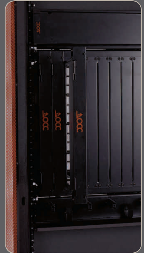
Procyon Fiber Panels mounted vertically