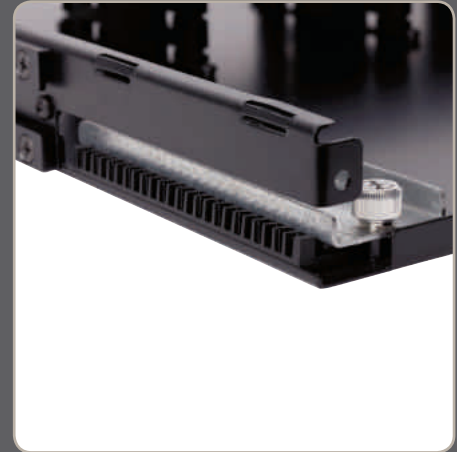
TempGrip cable management