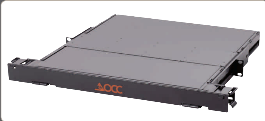
Procyon Fiber Panel