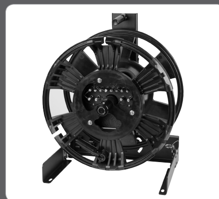
Shown with connector I/O access panel integrated Rio Reel

Replace "Y" with color code: B = black, G = carc green, T = desert tan