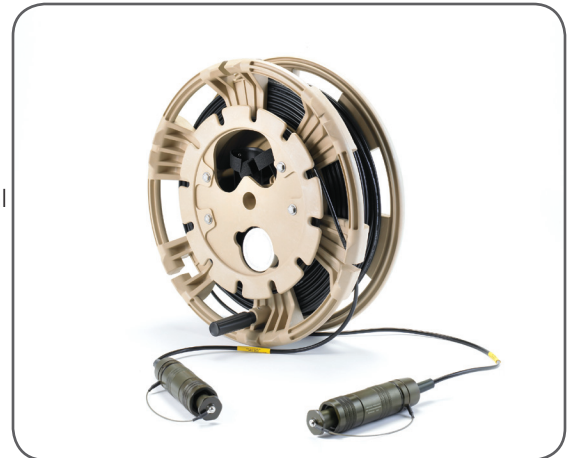
*TFOCA II® is a registered trademark of AFSI.