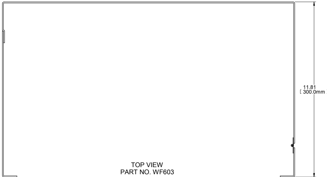
TOP VIEW PART NO. WF603