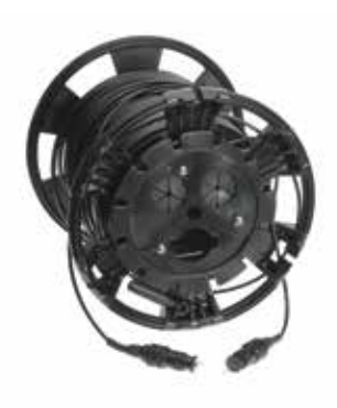
Plug-to-Plug Cable Assembly on OCC MARS Reel