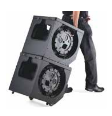
MARS Reels in Cartridge System