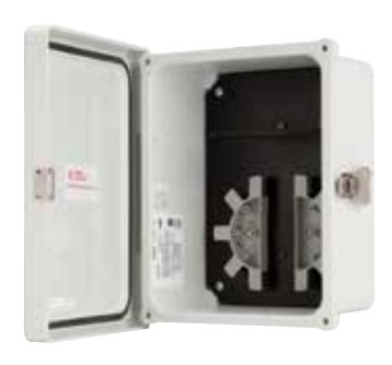
Harsh Environment Enclosures