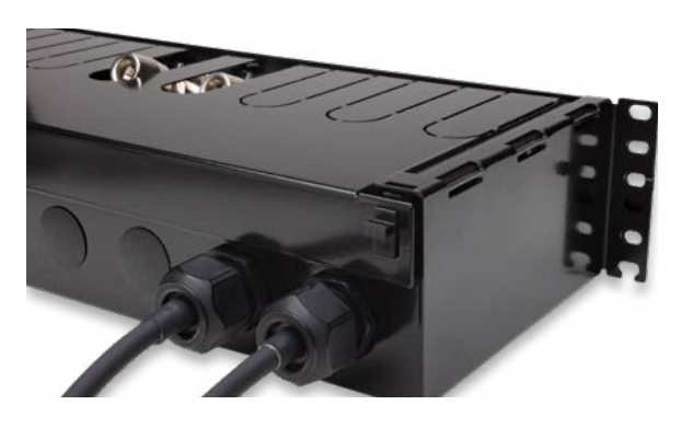
Full cable management available within the enclosure