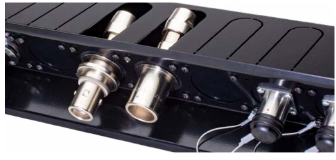
Unique reversible panel allows for inward or outward angle to save space